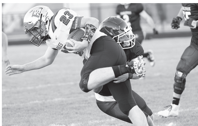
Charlevoix defense stops a high flying Benzie runner.